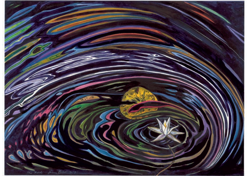
Swirl No. 2 (The Pond) 2017 Watercolor, gouache and graphite on paper 18 3/4 x 26 inches