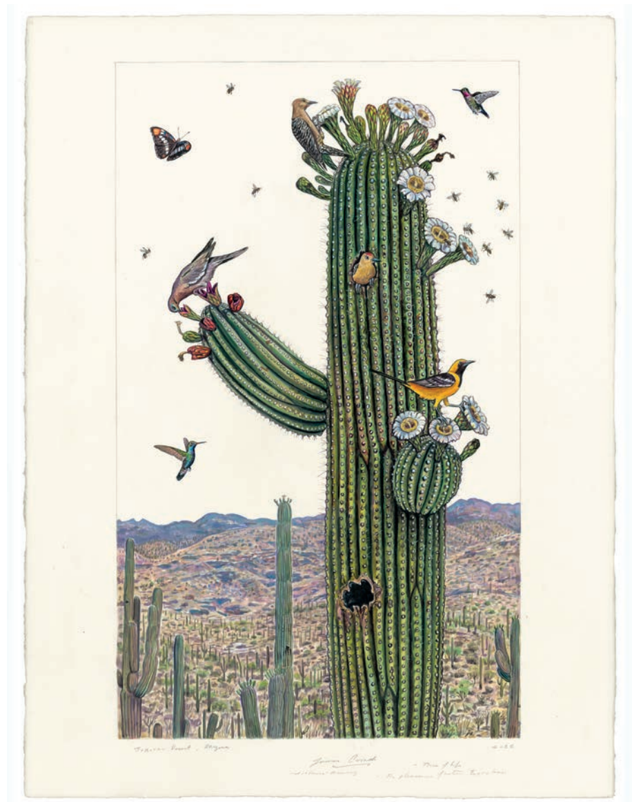
Sonoran Desert, No. 1 (Study)