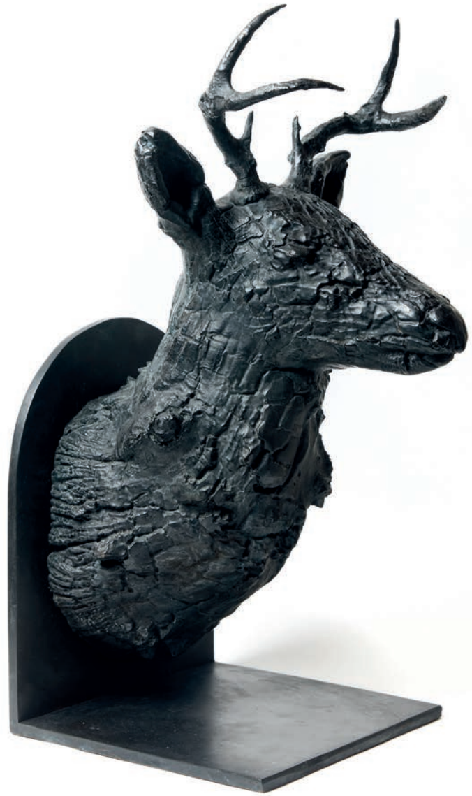
Deer 2022 Bronze 22 x 9 5/8 x 9 3/8 inches