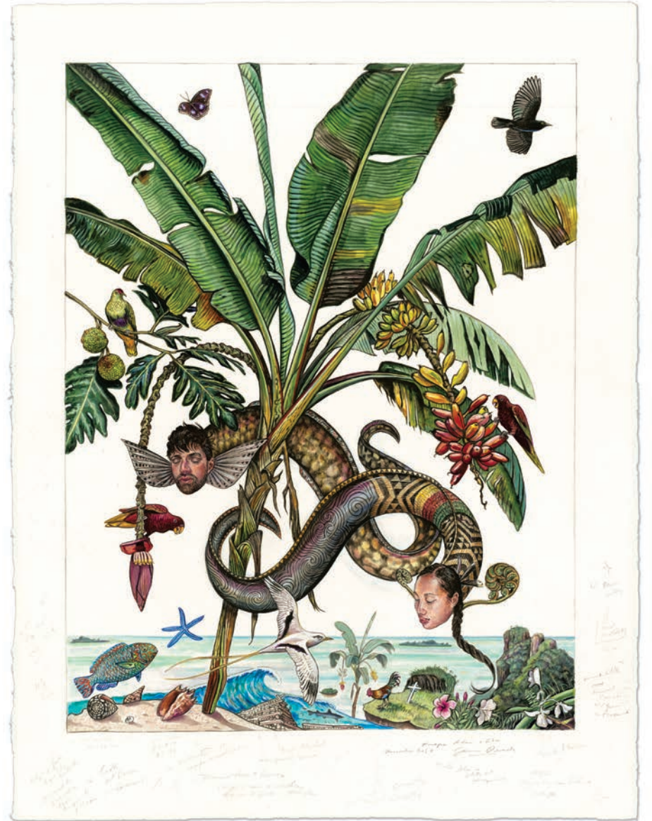
Study for Paradise Lost, Ponape 2019 Watercolor, gouache, colored pencil, & graphite on paper 24 1/2 x 18 1/2 inches