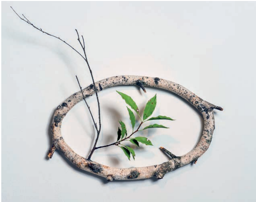
Myth of Order III 2020 Birch branches, clay, watercolor, acrylic, oil paint, & wire 11 1/2 x 17 1/2 x 1 1/2 inches