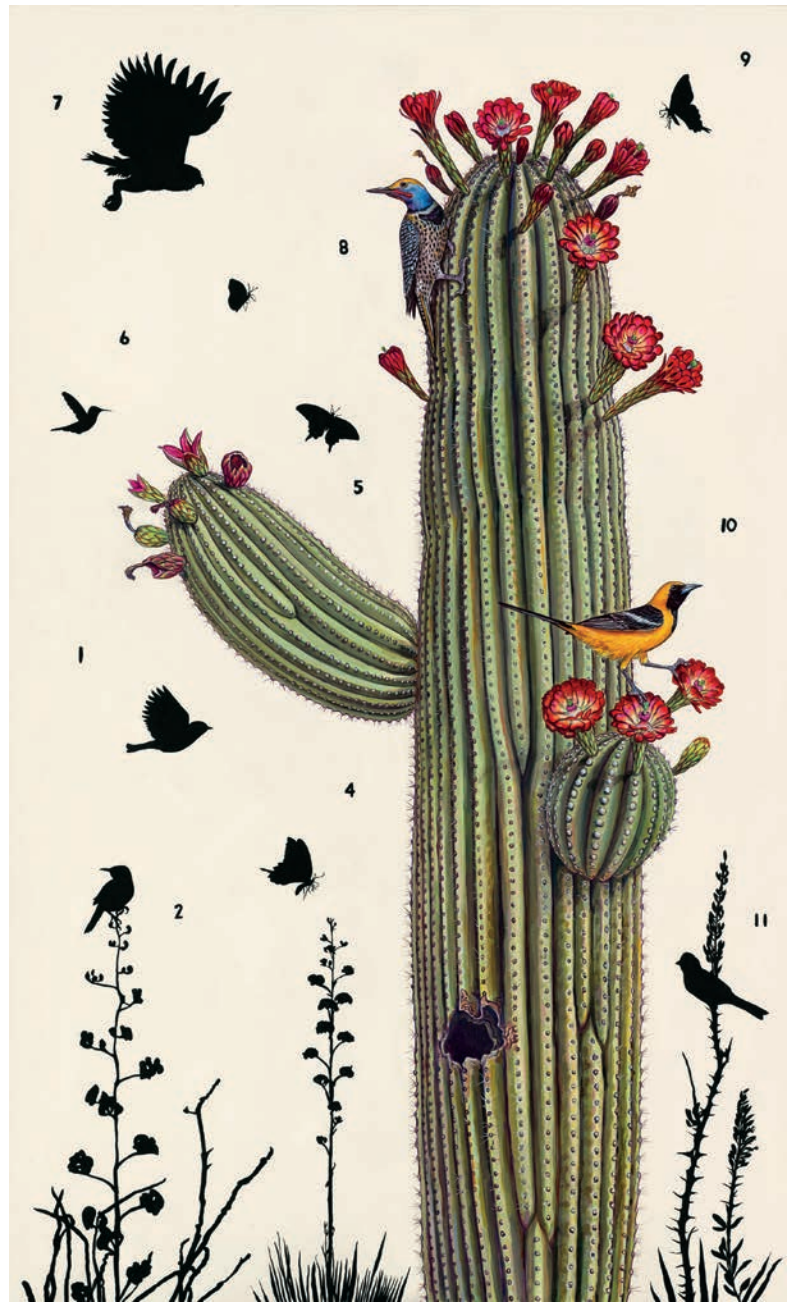
Sonoran Desert No. 1 2022 Watercolor & acrylic on panel 60 x 36 inches