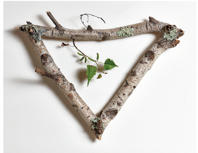
Myth of Order II 2020 Birch branches, clay, watercolor, acrylic, oil paint, & wire 11 1/2 x 17 1/2 x 1 1/2 inches