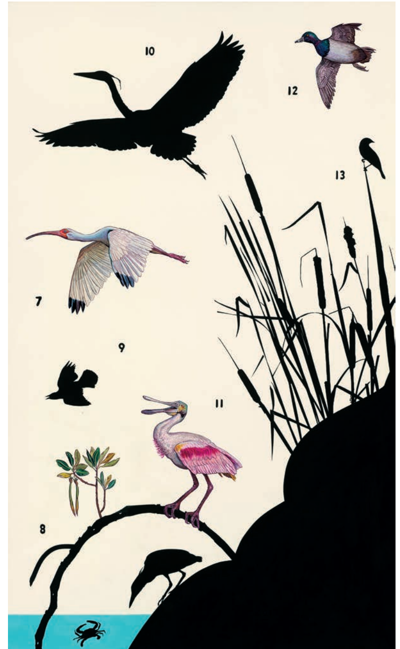
Texas Composition No. 2 2022 Acrylic on panel 60 x 36 inches