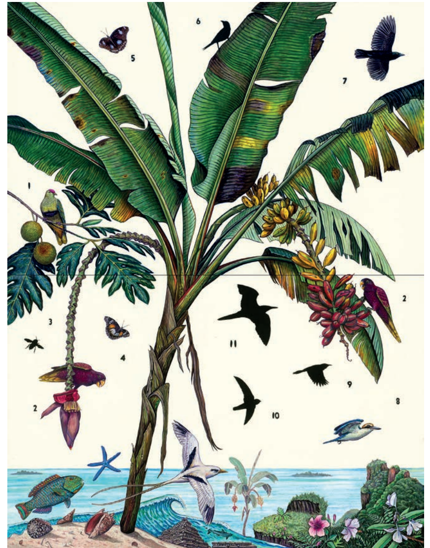
Paradise Lost, Ponape 2020 Watercolor & acrylic on panel 76 x 58 inches