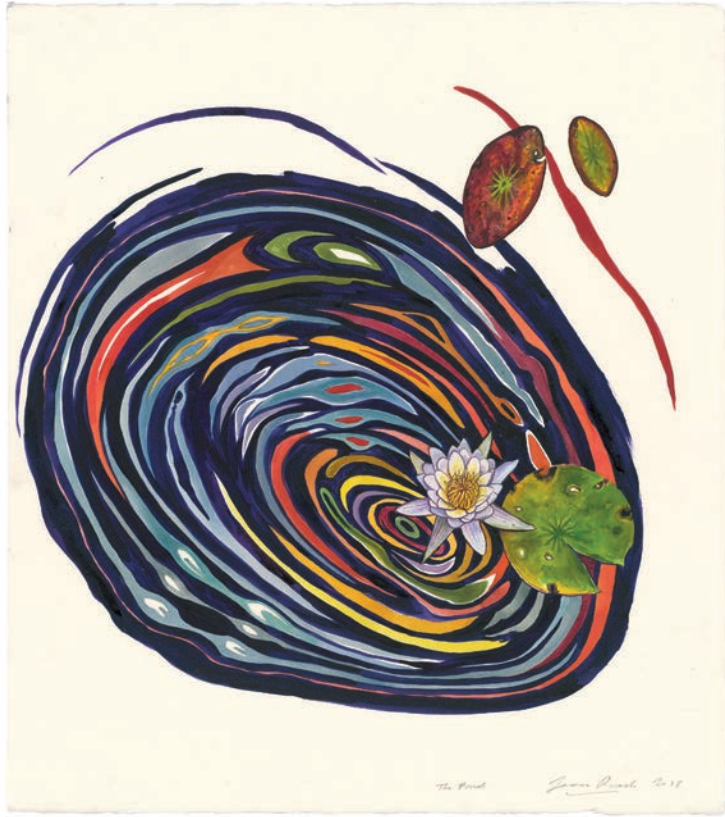
Swirl No. 1 (The Pond) 2018 Watercolor, gouache and graphite on paper 22 x 20 inches