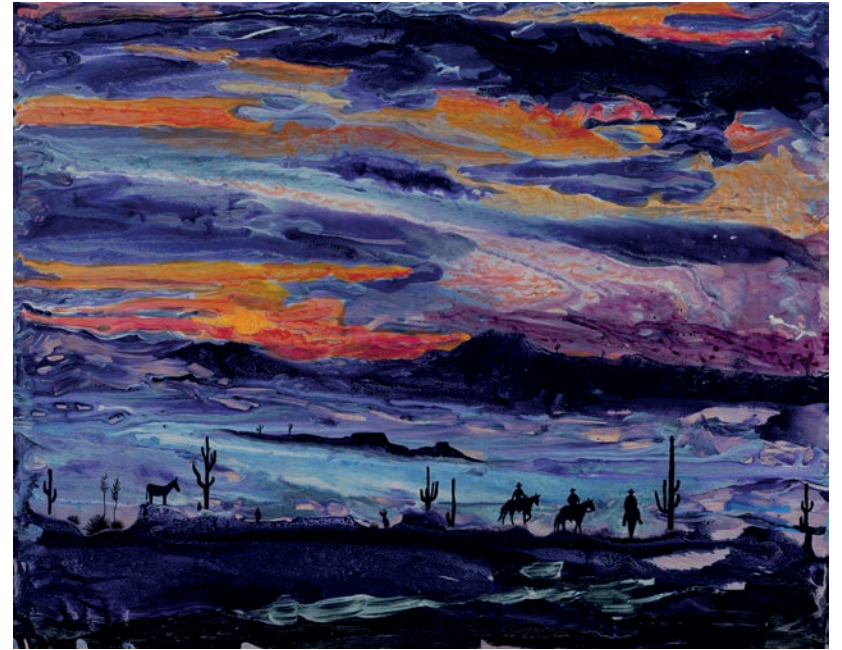
Wild West II 2017/2022 Watercolor, acrylic medium, & powdered mica on panel 19 x 24 inches