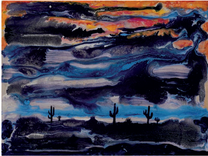
Wild West I 2017/2022 Watercolor, acrylic medium, & powdered mica on panel 9 x 12 inches