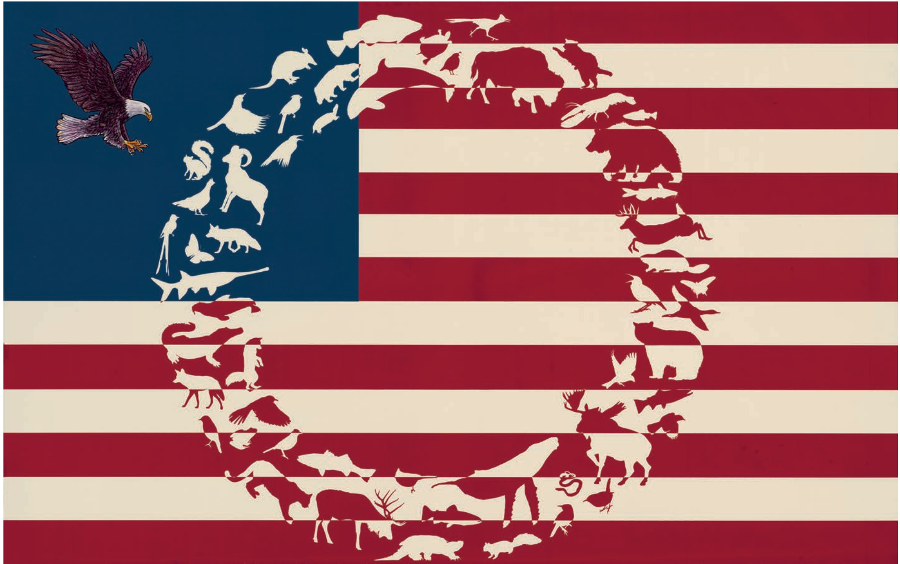
Invisible Boundaries No. 1 2021 Silk screen & oil on wood 22 1/2 x 36 inches