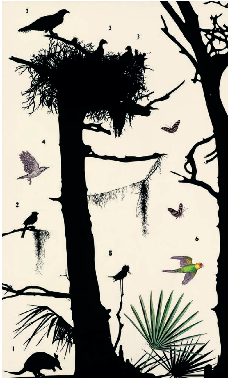
Texas Composition No. 1 2022 Acrylic on panel 60 x 36 inches