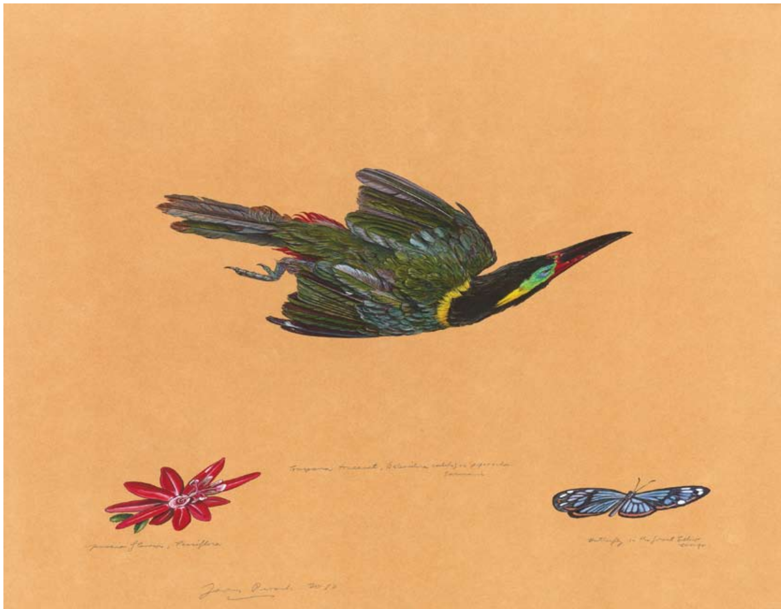
Guyana Toucanet with elements , 2010, watercolor and gouache on tea-stained paper, 21 3 / 4 x 27 3 / 4 inches