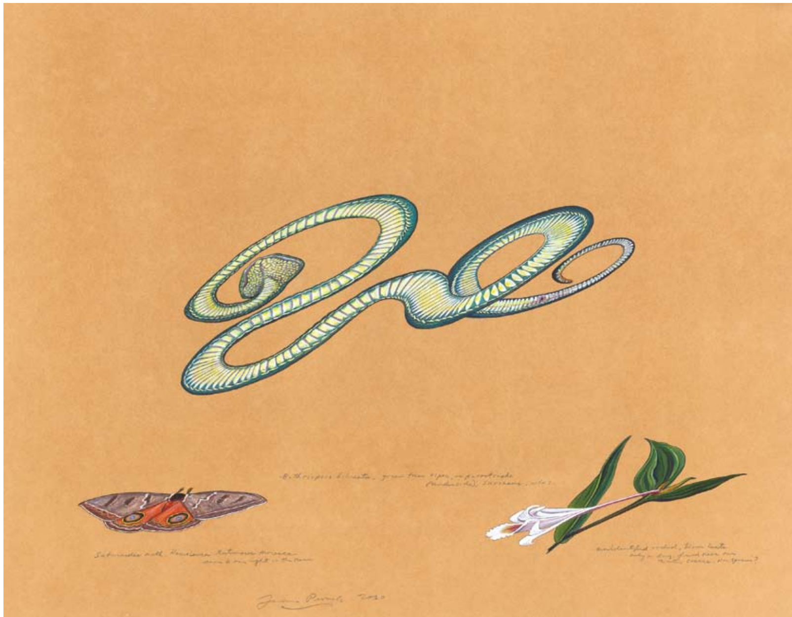
Green Tree Viper, or Parrotsnake (Underside) with elements, 2010 Watercolor and gouache on tea-stained paper, 21 \frac{3}{4} x 27 \frac{3}{4} inches