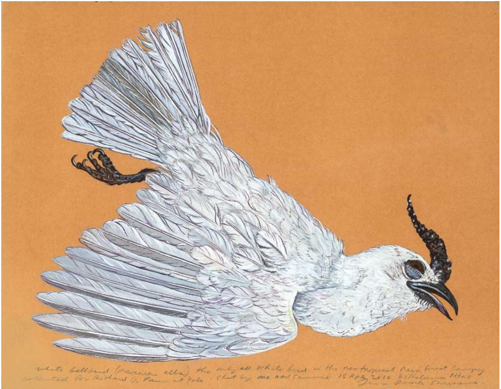
White Bellbird, 2010, watercolor and gouache on tea-stained paper, 9¼ x 12 inches