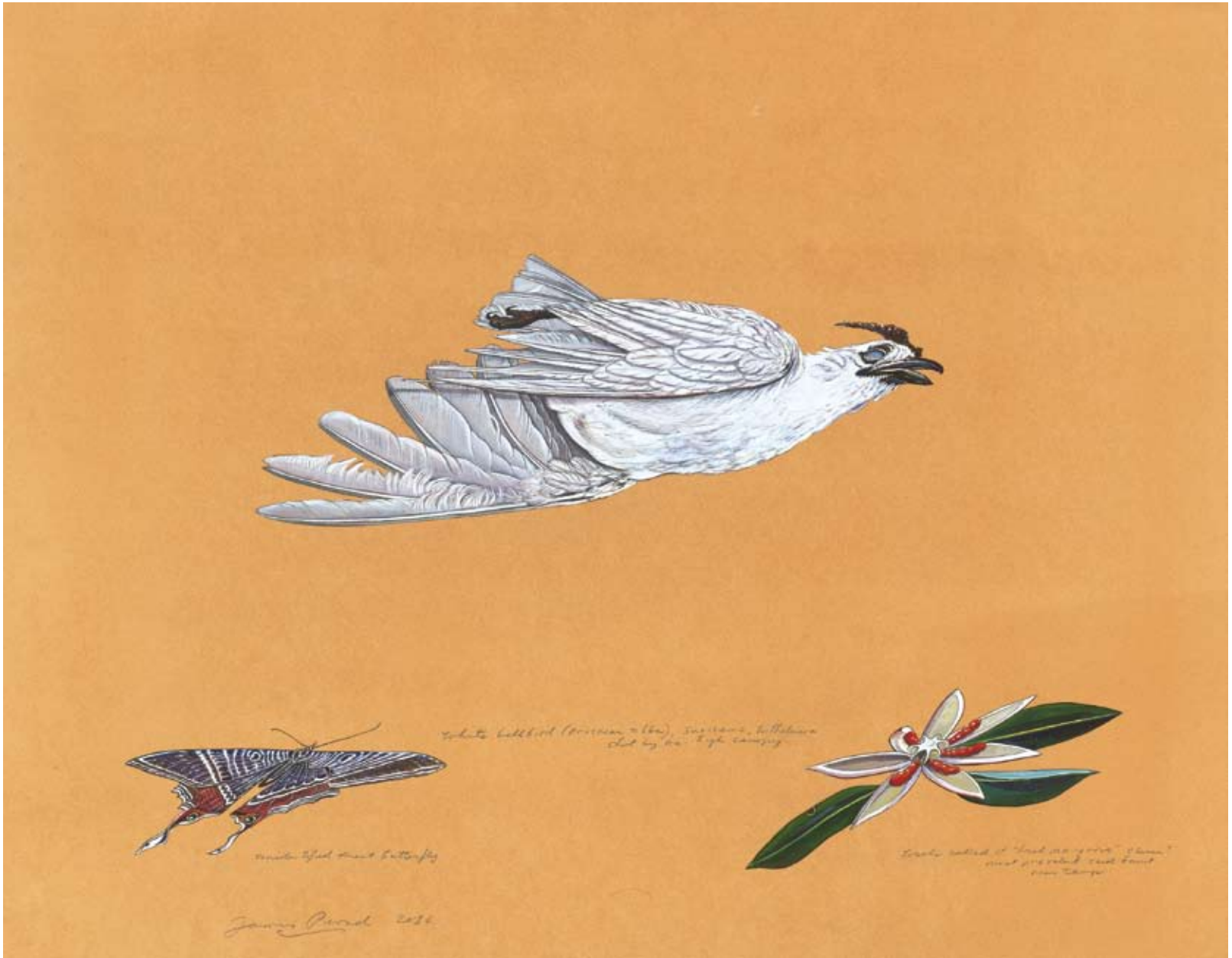
White Bellbird with elements, 2010, watercolor and gouache on tea-stained paper, 21 \frac{3}{4} x 27 \frac{3}{4} inches