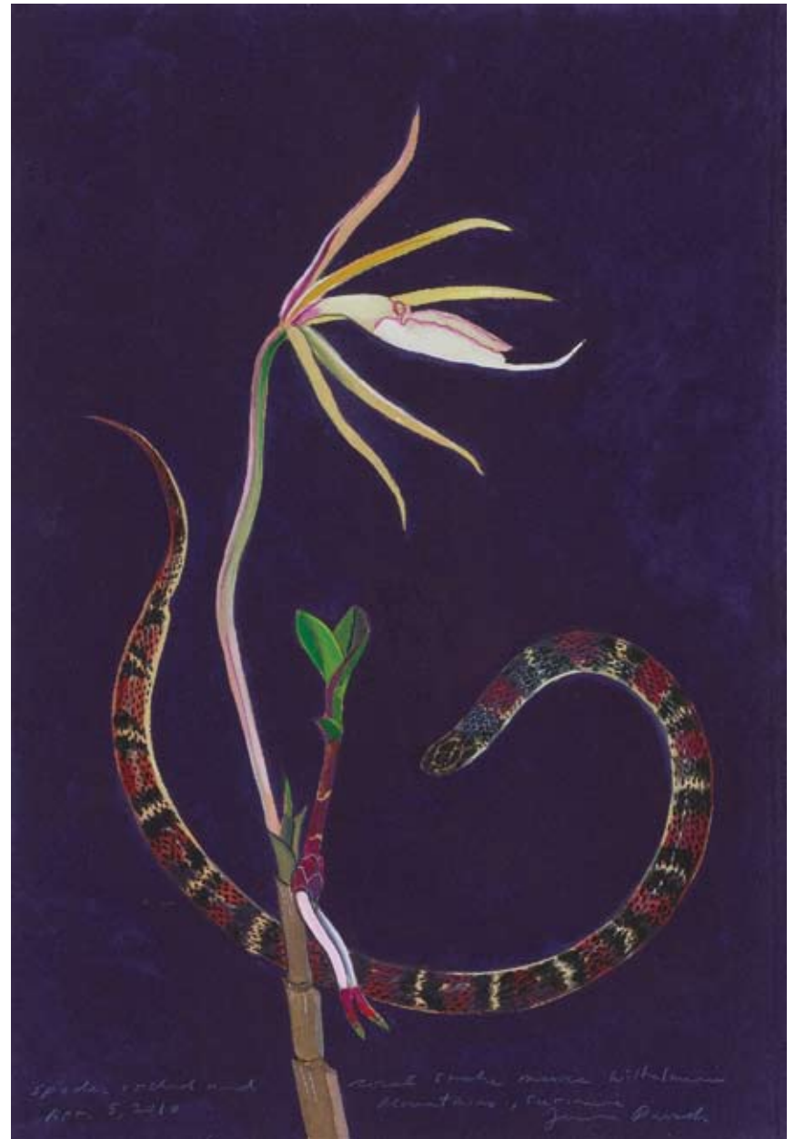
Left: Heliconia Flower with Frogs , 2010, watercolor and gouache on tea-stained paper, 12 x 8¼ inches Right: Spider Orchid and Coral Snake Mimic , 2010, watercolor and gouache on tea-stained paper, 11½ x 8 inches