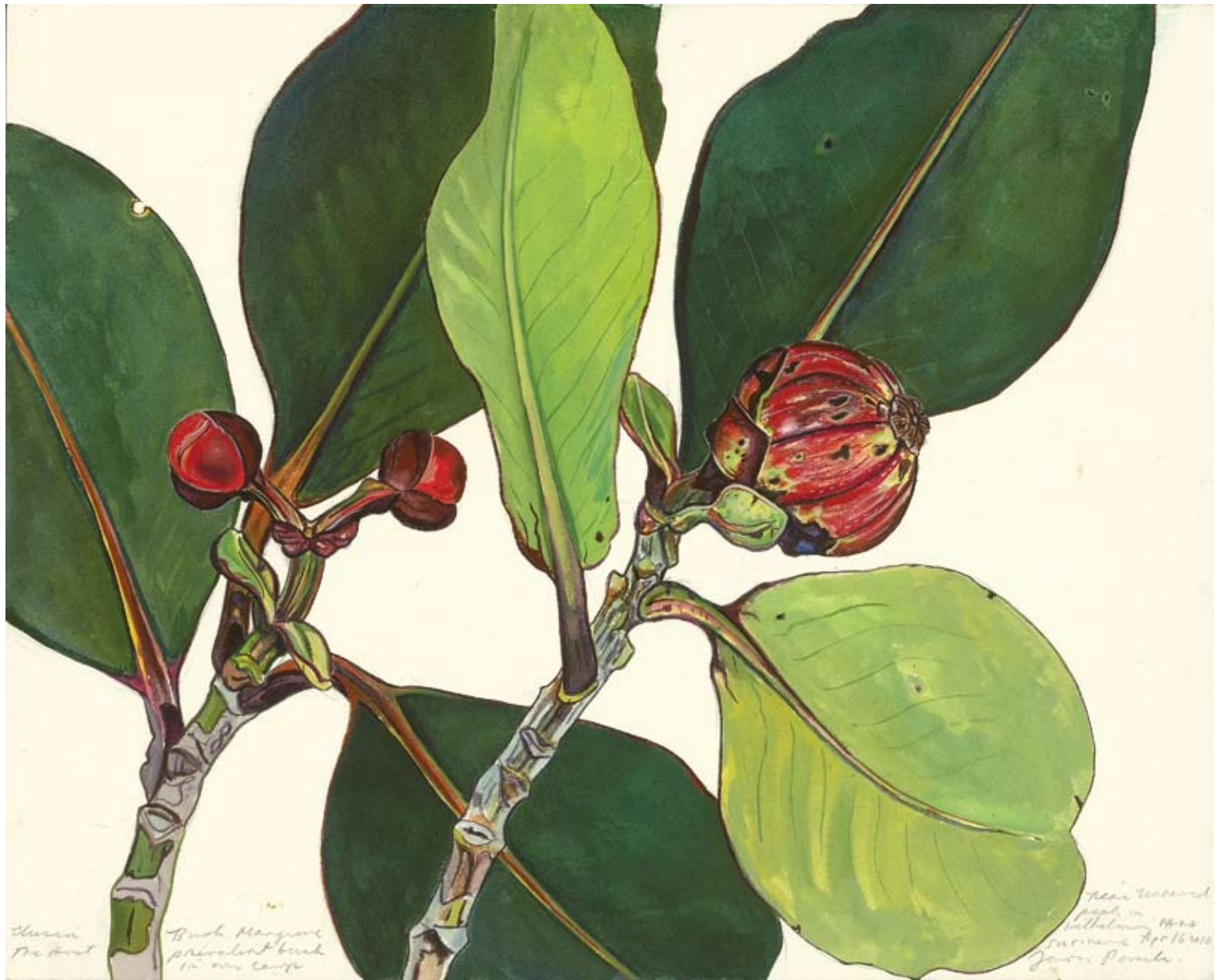
Clusia , or Bush Mangrove , 2010, watercolor and gouache on paper, 11½ x 14 inches