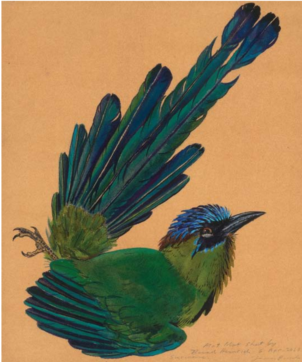
Motmot , 2010, watercolor and gouache on tea-stained paper, 12 x 10 inches