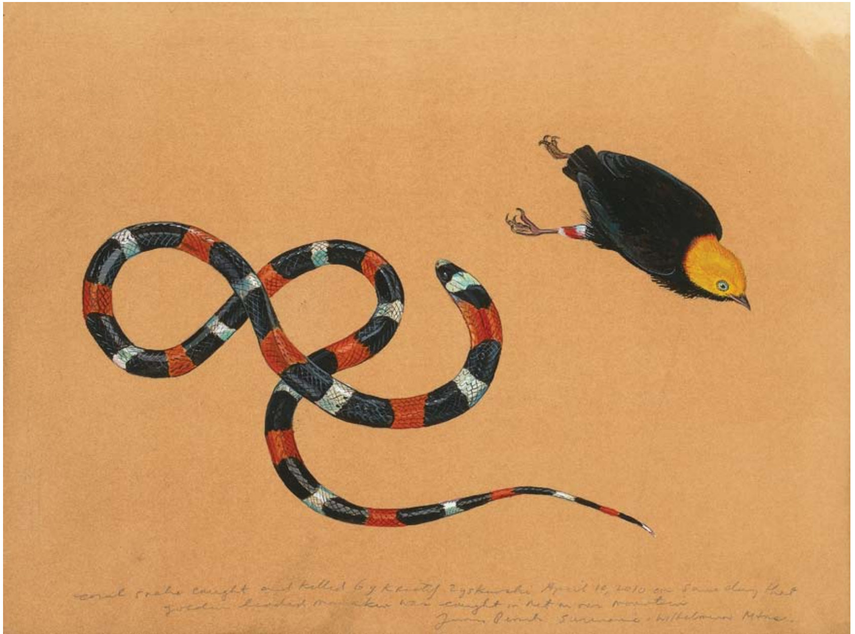
Coral Snake and Golden-Headed Manakin, 2010, watercolor and gouache on tea-stained paper, 9 x 11¾ inches