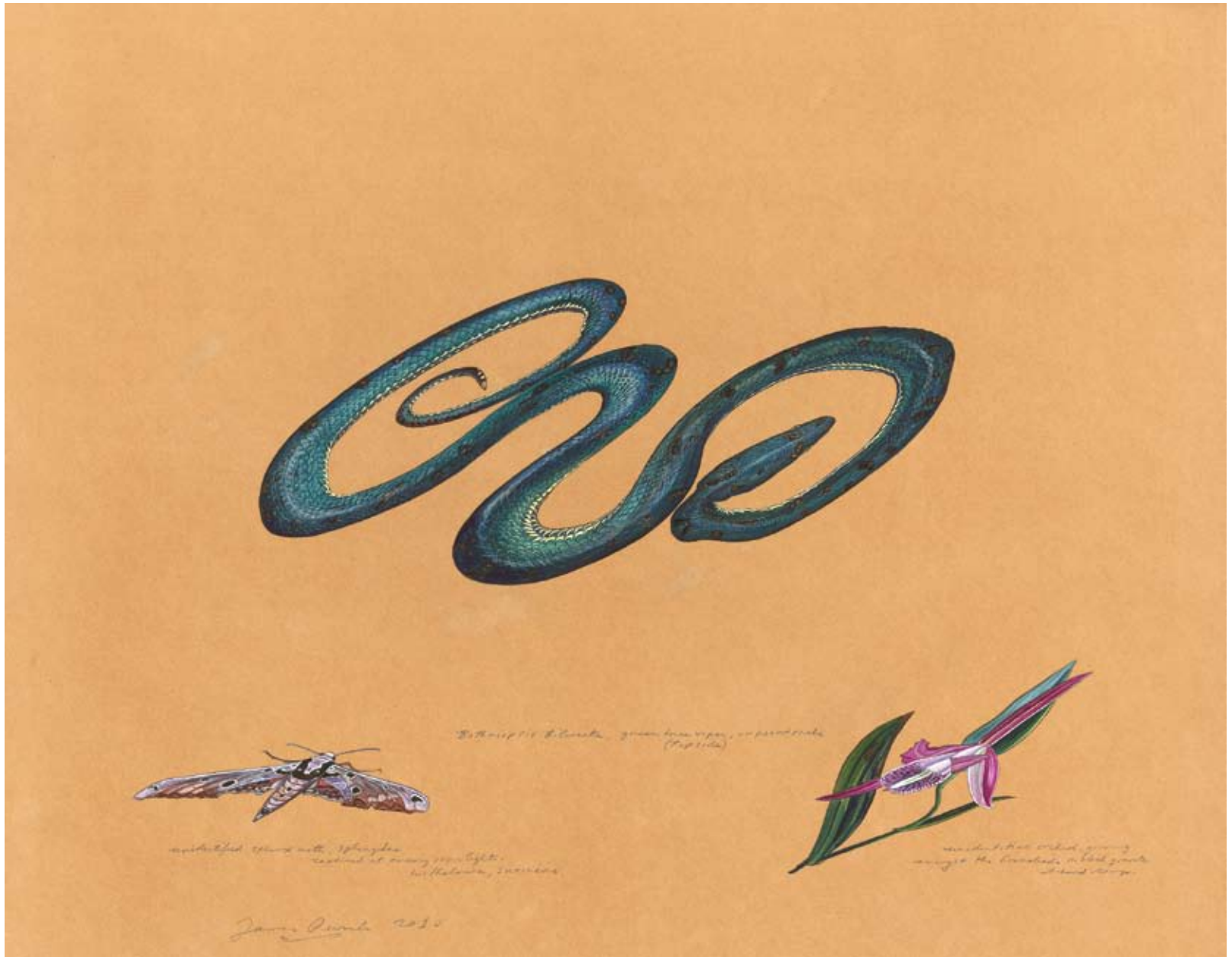
Green Tree Viper, or Parrotsnake (Topside) with elements, 2010 Watercolor and gouache on tea-stained paper, 21¾ x 27¾ inches